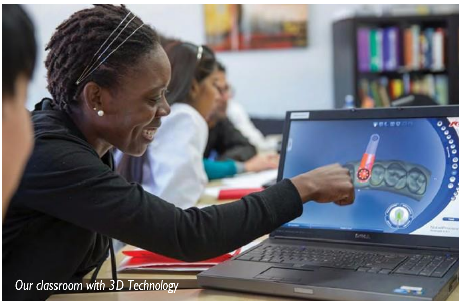
Our classroom with 3D Technology

College situated between Perth and the airport - 5 minutes from the city with good accommodation, transport and free parking available.