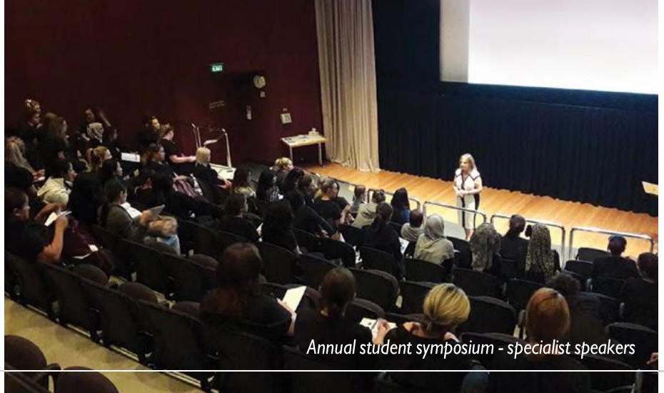
Annual student symposium - specialist speakers